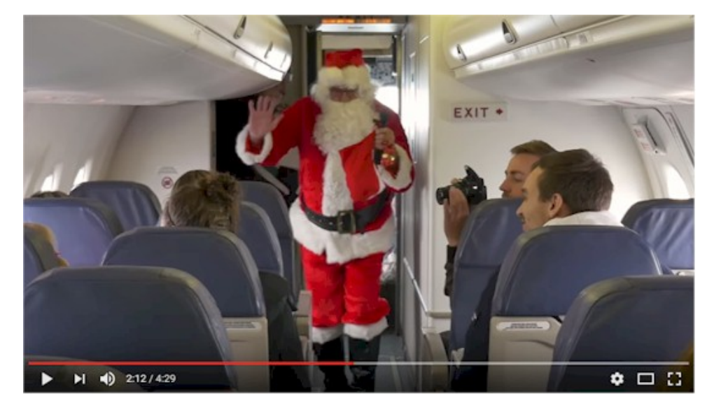
<u>Click Here</u> to view the YouTube video of "Searching for Santa" posted by AC Jazz.