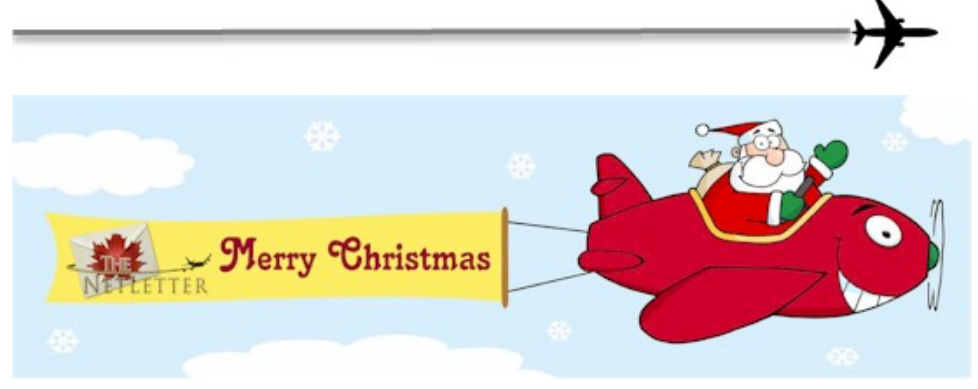
Happy Holidays from the NetLetter Team

Welcome to the NetLetter, an Aviation based newsletter for Air Canada, TCA, CPAir, Canadian Airlines and all other Canadian based airlines that once graced the Canadian skies.