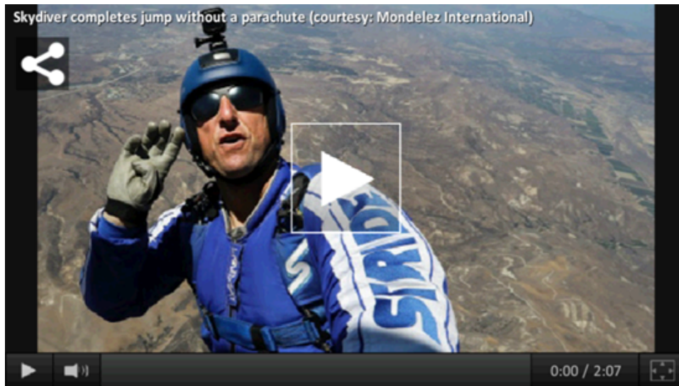
Skydiver completes jump without a parachute 2:07