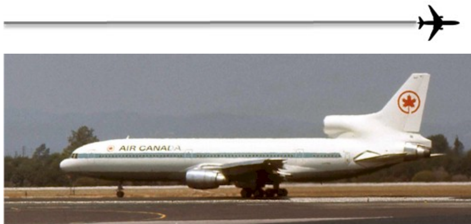
L1011 Fin#501 Haas-Turner (Air Canada & Eastern Airlines)

Welcome to the NetLetter, an Aviation based newsletter for Air Canada, TCA, CPAir, Canadian Airlines and all other Canadian based airlines that once graced the Canadian skies.