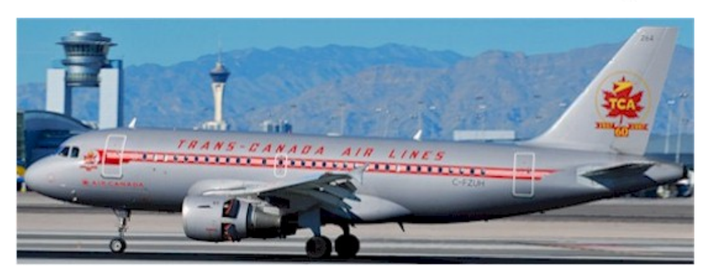
AC Airbus 319 FIN264 in TCA Livery

Welcome to the NetLetter, an Aviation based newsletter for Air Canada, TCA, CPAir, Canadian Airlines and all other Canadian based airlines that once graced the Canadian skies.