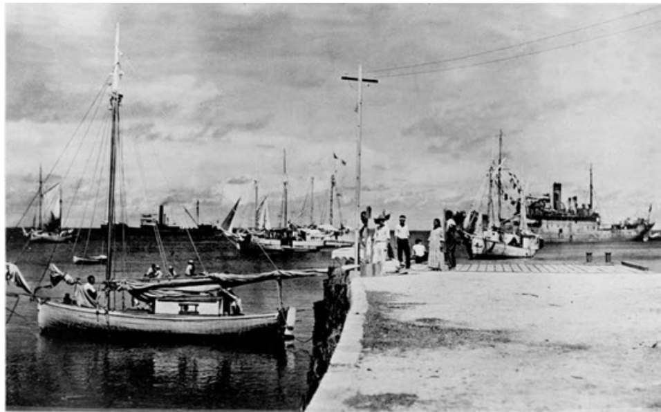
PL-MARSHALL ISLANDS, JALUIT ATOLL, JALUIT ISLAND. ONI #14381 JALUIT HARBOR.