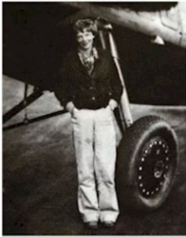
Earhart: missing 80 years

Eighty years ago on July 2nd, 1937 Amelia Earhart vanished on her mission to be the first woman to circumnavigate the globe.