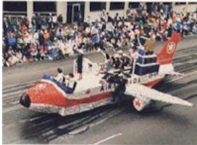
Calgary employees won first prize for their participation in the Stampede. The float represented by a B-767 and featured a cockpit, Executive Class seats and a gigantic 50th anniversary birthday cake.