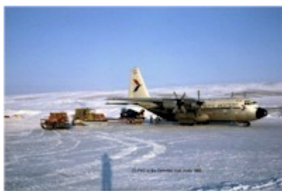
Loading in the high Arctic.

Pacific Western Hercules flew the rigs, fuel and their equipment, while L188 Electras, 737C and 727C combis flew the crew changes to/from Alberta. I have attached a few snaps from that era to show the size of some of the loads.