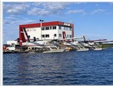
View of three Air Tindi, Twin Otter airplanes, Yellowknife

Discovery Air Inc/ Air Tindi Ltd , a northern based airline (Yellowknife, NWT), is providing a diverse fleet of turboprop aircraft services, serving Fort Simpson, Whati, Gameti, Wekweeti and Lutsel K'e from Yellowknife.