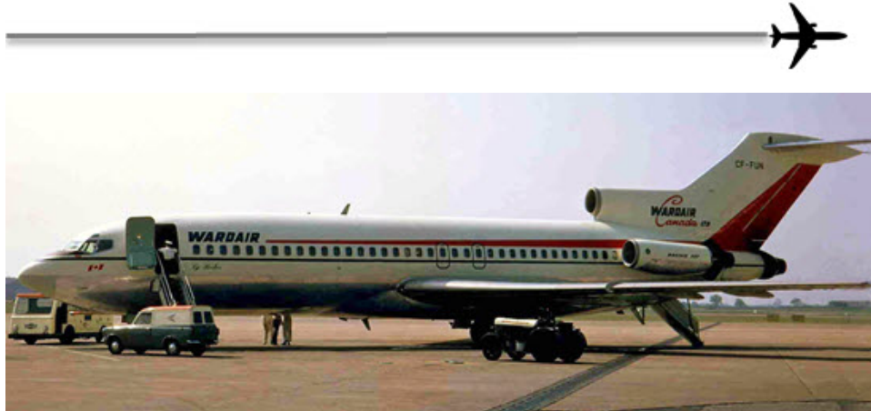
Wardair CF-FUN B-727-11 (June 1970)