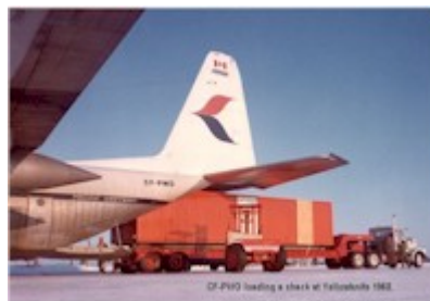
Loading a workers shack at Yellowknife.