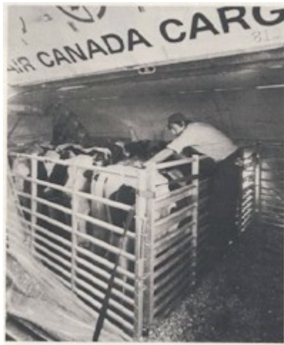
These aluminum enclosures on board a DC-8 freighter are like a stall for the cattle. Each one can hold up to eight cows.

Anyone who has travelled on a B-767 Rouge cor in economy class can understand where the idea for the additional economy seating configuration came from in this image of loading cattle on to a DC-8 freighter in 1979 - except the cattle had more leg room!