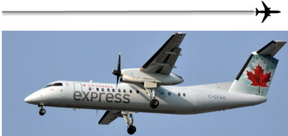
Air Canada Express - Dash 8 Q300, C-GTAG - YVR