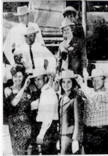
Buffalo Days flight to YUL Expo 67 July 7th 1967. Regina.

On July 7th, 1967, six crew members of Pacific Western Airlines, who were operating over 40 flights from Western Canada to Expo 67 that summer, were presented with Buffalo Days hats before taking 94 passengers, mostly Saskatchewan Government Telephones employees, from Regina to Montreal.