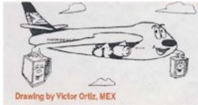
This drawing by Victor Ortiz, MEX is from the "Info Cargo" magazine issue March 1992 .