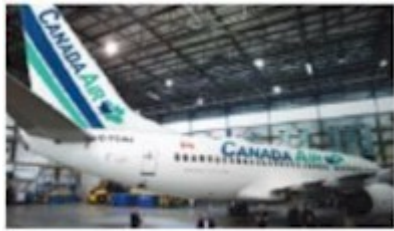
Just as Canadian as you

The no-frills airline's "announcement" that it was rebranding as Canada Air - a none-too-subtle dig at its flag carrying rival - was accompanied by images of a very convincing mock-up of one of its Boeing 737s in the