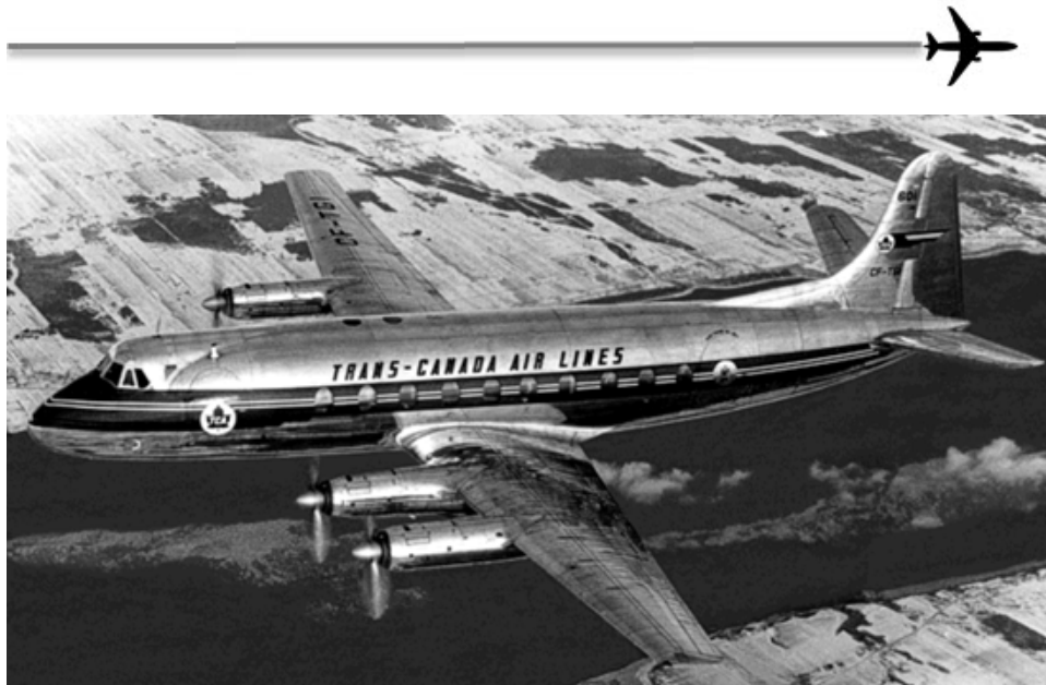
TCA Vickers Viscount - CF-TGI