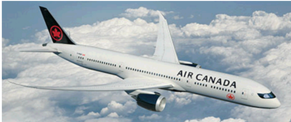
New Air Canada livery - February 2017