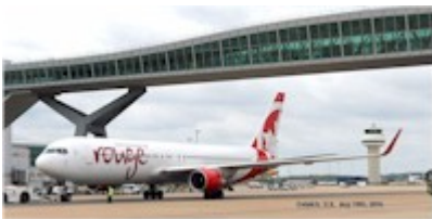
Rouge aircraft at Gatwick, UK on May 19th, 2016.