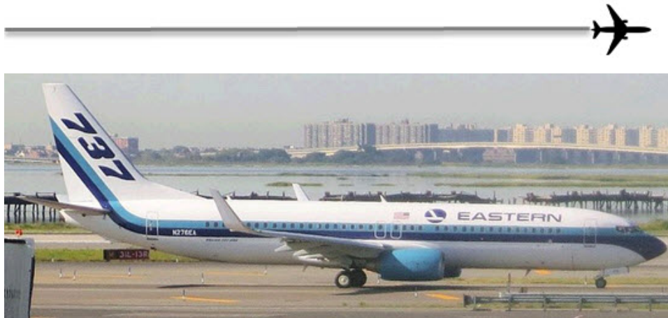
Eastern Air Lines Boeing 737-800 at JFK