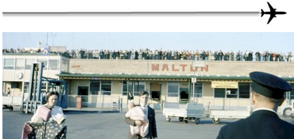
YYZ "TCA" Terminal Observation Rooftop in 1960

Welcome to the NetLetter, an Aviation based newsletter for Air Canada, TCA, CP Air, Canadian Airlines and all other Canadian based airlines that once graced the Canadian skies.