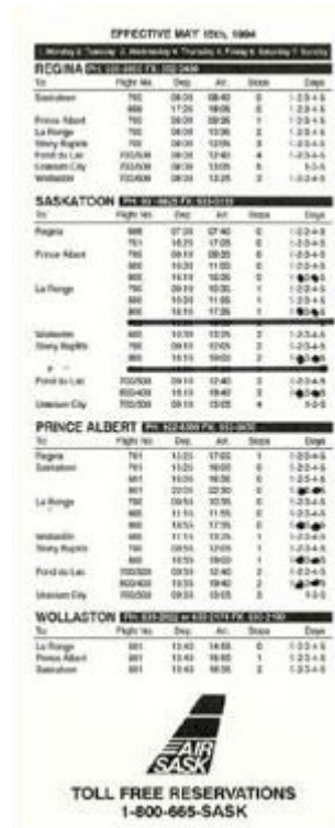
Air Sask timetable effective May 1994.