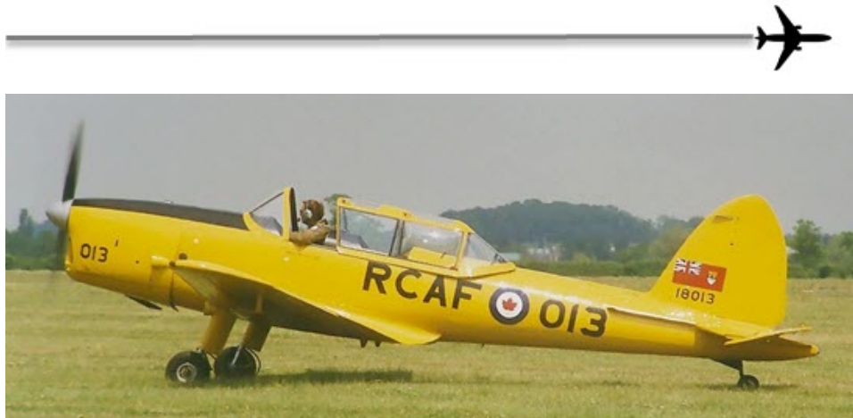
RCAF De Havilland DHC-1B Chipmunk

Welcome to the NetLetter, an Aviation based newsletter for Air Canada, TCA, CP Air, Canadian Airlines and all other Canadian based airlines that once graced the Canadian skies.