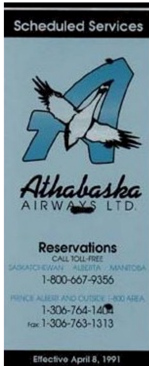
Athabaska Airways Ltd timetable effective April 1991.