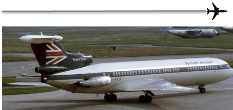
British Airways Trident Three Registration G-AWZA

Welcome to the NetLetter, an Aviation based newsletter for Air Canada, TCA, CP Air, Canadian Airlines and all other Canadian based airlines that once graced the Canadian skies.