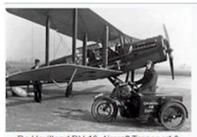
De Havilland DH.16, Aircraft Transport & Travel, probably Croydon 1920

On August 25, 1919, a small British built biplane took off from the Hounslow Heathland to LeBourget, Paris.