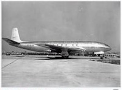
Comet 1 prototype (with square windows) at Hatfield, Hertfordshire in October 1949.