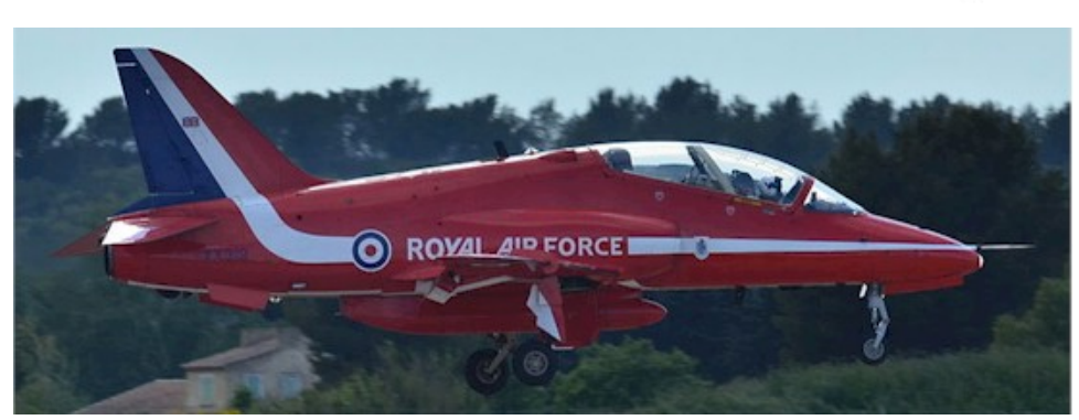
Hawker Siddeley Hawk T1A Royal Air Force "Red Arrows"

Welcome to the NetLetter, an Aviation based newsletter for Air Canada, TCA, CP Air, Canadian Airlines and all other Canadian based airlines that once graced the Canadian skies.