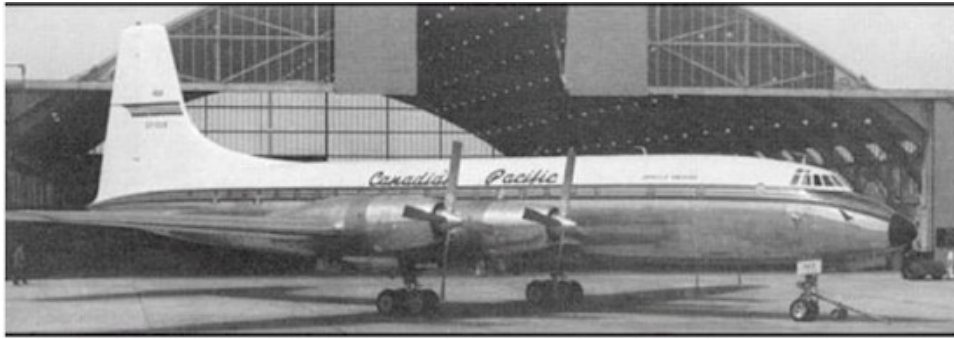
Bristol Britannia at Vancouver - hangar in background (still standing today on the south side of the airport) was built for the Britannia (it was big enough for two) and was always known as "the Britannia Hangar" long after the type was retired.