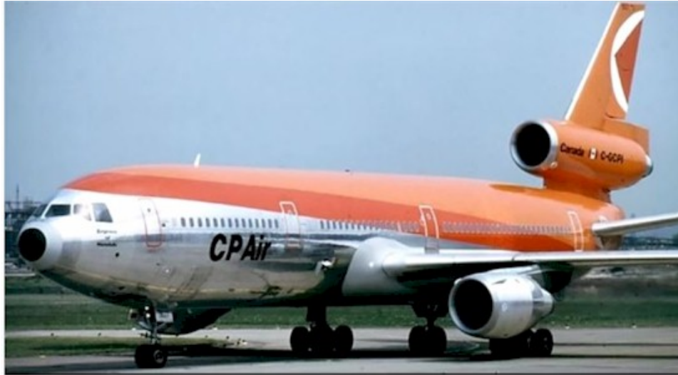
McDonnell Douglas DC-10-30 (not sure where).

"goose" livery (for the Canada goose on the tail) lasted until the orange CP Air branding was introduced in late 1968.