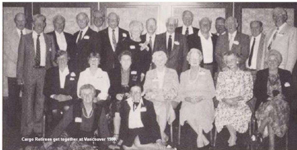
Cargo Retirees get together at Vancouver 1988.