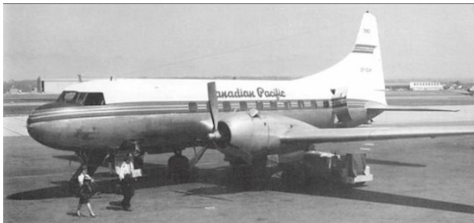
Convair 240 at the now closed Edmonton Municipal Airport (YXD).