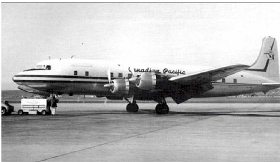
Douglas DC-6B at what looks like Vancouver. That livery was introduced with the first DC-8s in 1961 and replaced the livery seen on the Britannia and Convair 240 above. That