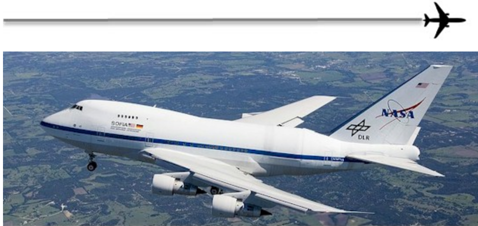
Boeing 747SP - SOFIA

Welcome to the NetLetter, an Aviation based newsletter for Air Canada, TCA, CP Air, Canadian Airlines and all other Canadian based airlines that once graced the Canadian skies.