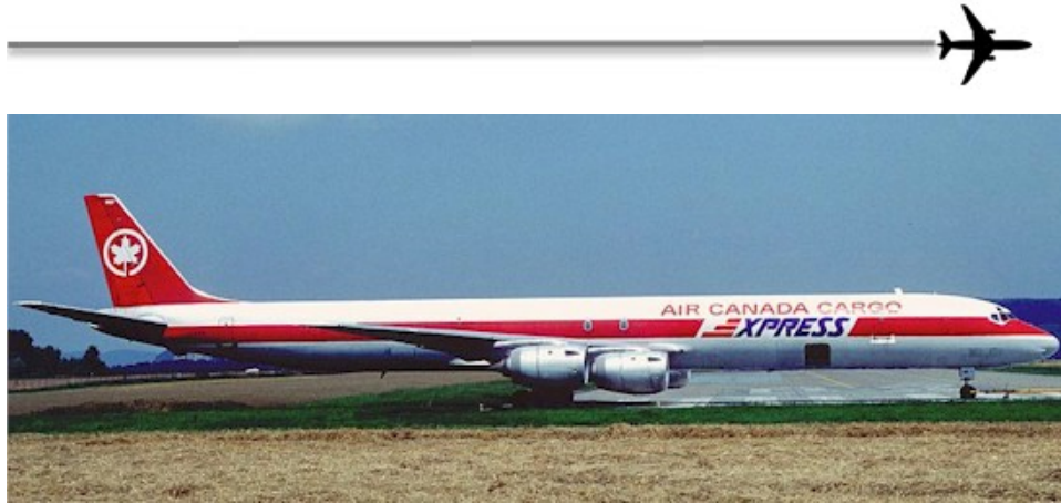
Air Canada Cargo Express DC-8-73F - Fin# 867 - C-FTIK