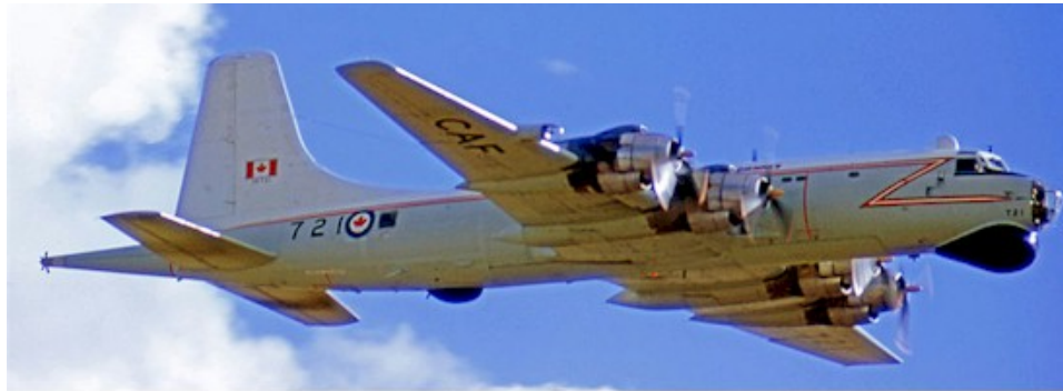
Canadair CP-107 Argus (CL-28)