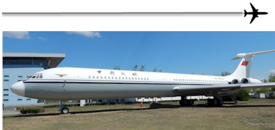
Ilyushin Il-62 Registration B-2024 at the Beijing Aviation Museum