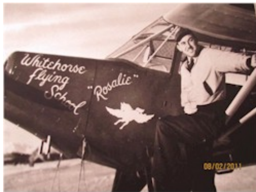
This photo of the aircraft of the Whitehorse Flying School .