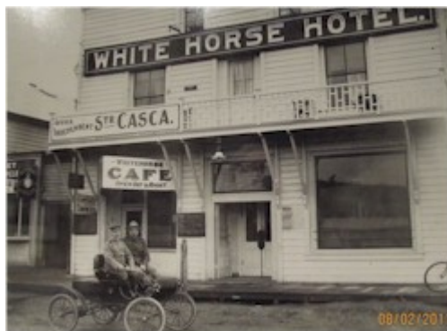
Two photos of the Whitehorse Hotel .